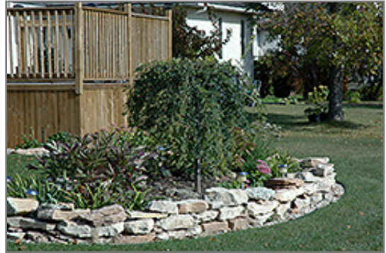
Weeping Peashrub

This shrub does best in full sun to partial shade. It prefers dry to average moisture levels with very well-drained soil, and will often die in standing water. It is considered to be drought-tolerant, and thus makes an ideal choice for xeriscaping or the moisture-conserving landscape. It is not particular as to soil type or pH, and is able to handle environmental salt. It is highly tolerant of urban pollution and will even thrive in inner city environments. This is a selected variety of a species not originally from North America.