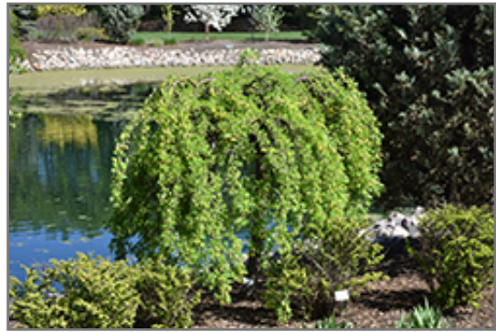
Weeping Peashrub