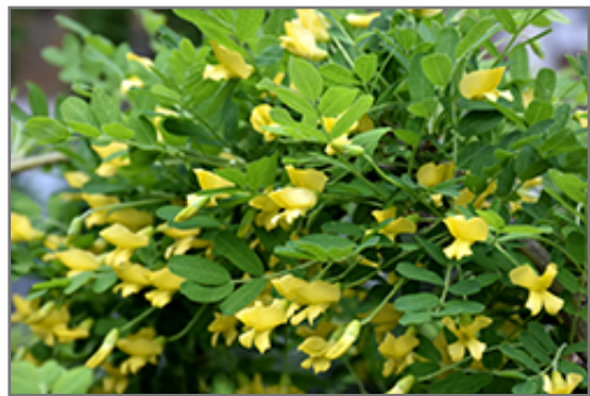
Weeping Peashrub flowers