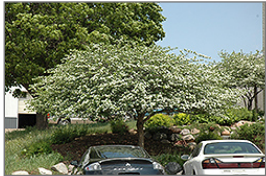
Thornless Cockspur Hawthorn in bloom