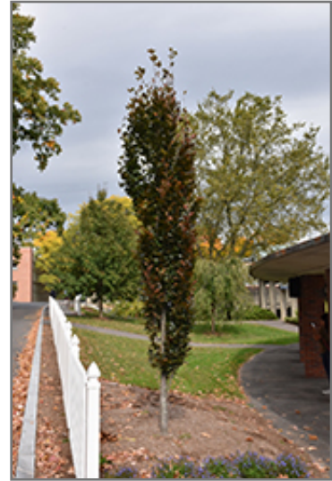
Dawyck Purple Beech