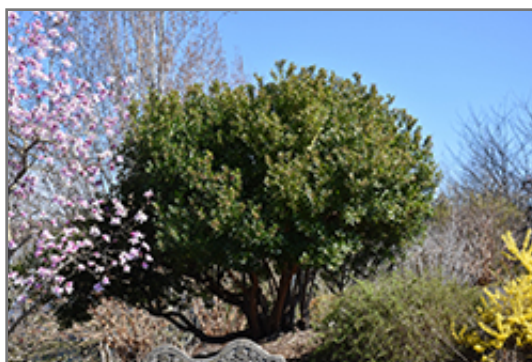
Strawberry Tree