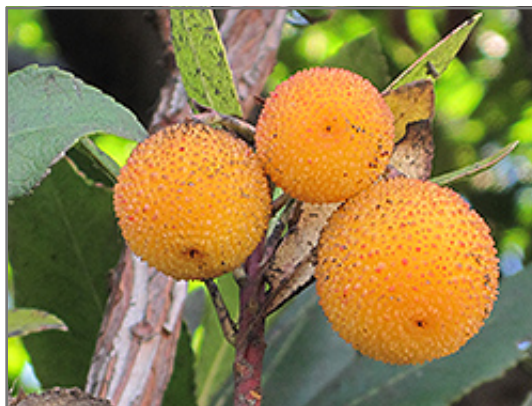
Strawberry Tree fruit

Strawberry Tree is recommended for the following landscape applications;