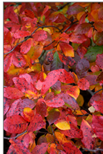
Black Gum in fall