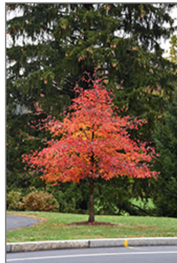
Black Gum in fall