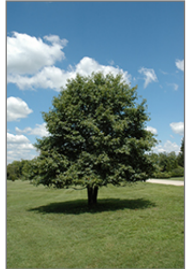
Black Gum

This tree does best in full sun to partial shade. It does best in average to evenly moist conditions, but will not tolerate standing water. It is very fussy about its soil conditions and must have rich, acidic soils to ensure success, and is subject to chlorosis (yellowing) of the foliage in alkaline soils. It is quite intolerant of urban pollution, therefore inner city or urban streetside plantings are best avoided, and will benefit from being planted in a relatively sheltered location. Consider applying a thick mulch around the root zone in winter to protect it in exposed locations or colder microclimates. This species is native to parts of North America.