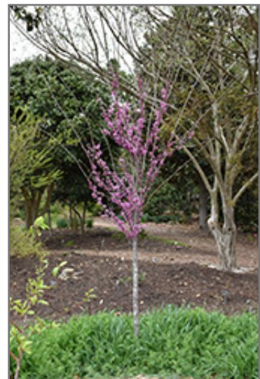
Summer's Tower Redbud in bloom