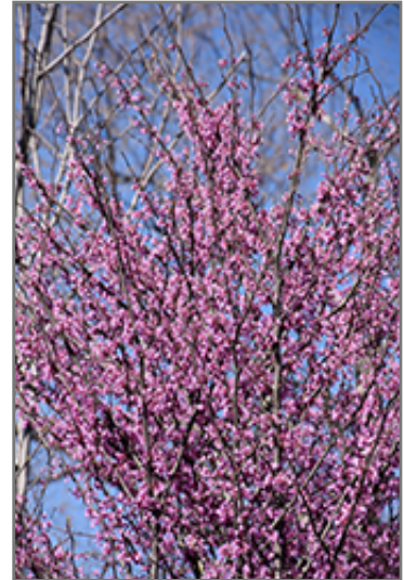
Summer's Tower Redbud flowers

This tree does best in full sun to partial shade. It prefers to grow in average to moist conditions, and shouldn't be allowed to dry out. It is not particular as to soil type or pH. It is highly tolerant of urban pollution and will even thrive in inner city environments, and will benefit from being planted in a relatively sheltered location. Consider applying a thick mulch around the root zone in winter to protect it in exposed locations or colder microclimates. This is a selection of a native North American species.