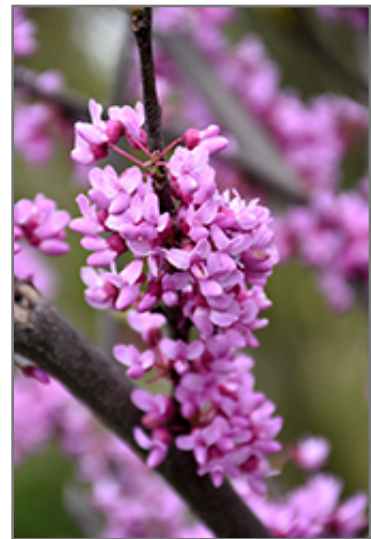
Summer's Tower Redbud flowers