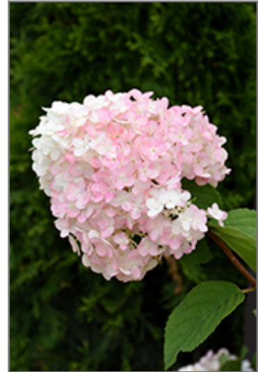
Strawberry Shake Hydrangea flowers

Strawberry Shake Hydrangea will grow to be about 5 feet tall at maturity, with a spread of 4 feet. It tends to be a little leggy, with a typical clearance of 2 feet from the ground, and is suitable for planting under power lines. It grows at a medium rate, and under ideal conditions can be expected to live for 40 years or more.