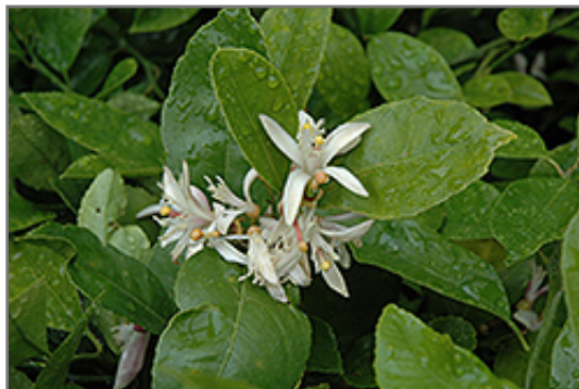
Improved Meyer Lemon flowers

Aside from its primary use as an edible, Improved Meyer Lemon is suitable for the following landscape applications;