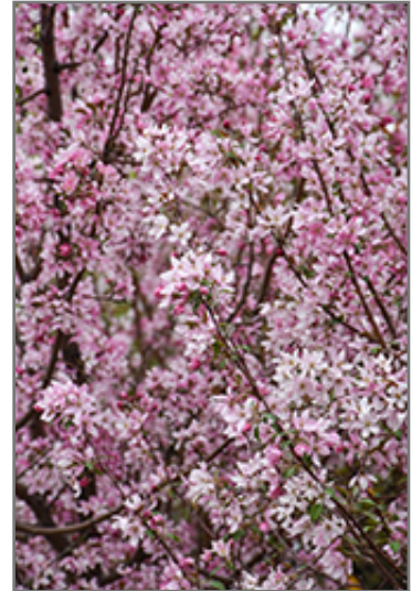
Pink Spires Flowering Crab flowers

This tree should only be grown in full sunlight. It prefers to grow in average to moist conditions, and shouldn't be allowed to dry out. It is not particular as to soil type or pH. It is highly tolerant of urban pollution and will even thrive in inner city environments. This particular variety is an interspecific hybrid.