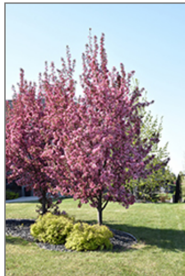
Pink Spires Flowering Crab in bloom

Pink Spires Flowering Crab is recommended for the following landscape applications;