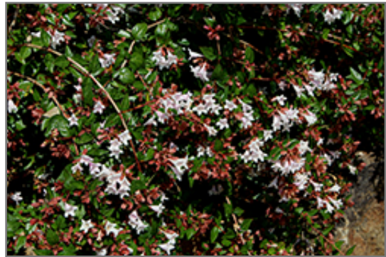
Edward Goucher Abelia flowers

Edward Goucher Abelia is recommended for the following landscape applications;