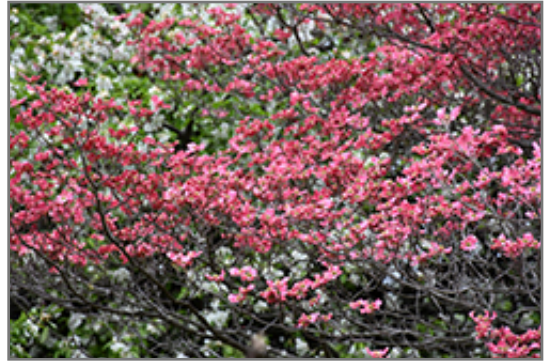
Cherokee Chief Flowering Dogwood flowers

Cherokee Chief Flowering Dogwood will grow to be about 30 feet tall at maturity, with a spread of 35 feet. It has a low canopy with a typical clearance of 4 feet from the ground, and should not be planted underneath power lines. It grows at a slow rate, and under ideal conditions can be expected to live for approximately 30 years.