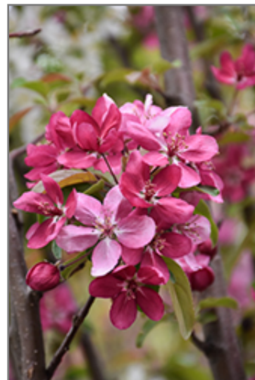
Velvet Pillar Flowering Crab flowers