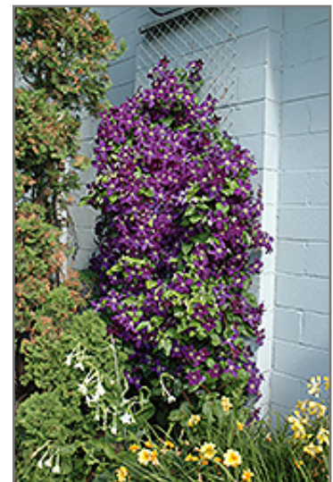
Jackmanii Superba Clematis in bloom