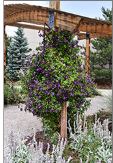
Jackmanii Superba Clematis in bloom

Jackmanii Superba Clematis makes a fine choice for the outdoor landscape, but it is also well-suited for use in outdoor pots and containers. Because of its spreading habit of growth, it is ideally suited for use as a 'spiller' in the 'spiller-thriller-filler' container combination; plant it near the edges where it can spill gracefully over the pot. It is even sizeable enough that it can be grown alone in a suitable container. Note that when grown in a container, it may not perform exactly as indicated on the tag - this is to be expected. Also note that when growing plants in outdoor containers and baskets, they may require more frequent waterings than they would in the yard or garden.