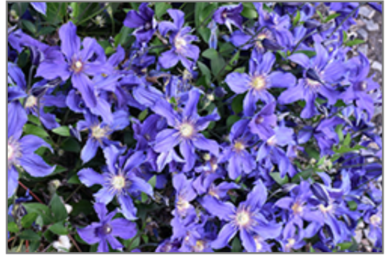
Sapphire Indigo Clematis flowers

Sapphire Indigo Clematis will grow to be about 5 feet tall at maturity, with a spread of 24 inches. As a climbing vine, it tends to be leggy near the base and should be underplanted with low-growing facer plants. It should be planted near a fence, trellis or other landscape structure where it can be trained to grow upwards on it, or allowed to trail off a retaining wall or slope. It grows at a medium rate, and under ideal conditions can be expected to live for approximately 20 years.