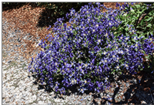
Sapphire Indigo Clematis in bloom