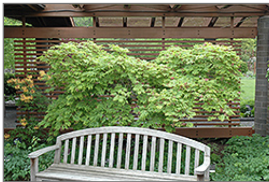
Cutleaf Fullmoon Maple