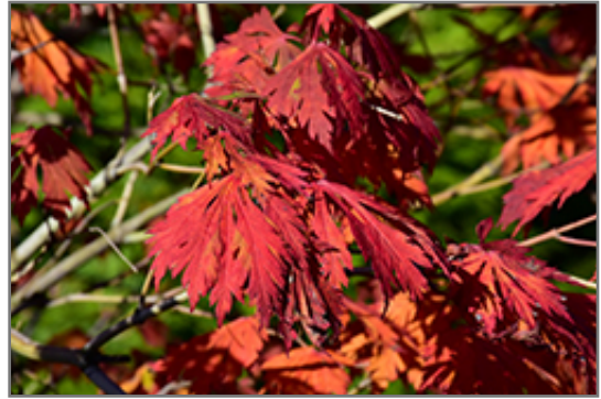
Cutleaf Fullmoon Maple in fall

This tree does best in full sun to partial shade. You may want to keep it away from hot, dry locations that receive direct afternoon sun or which get reflected sunlight, such as against the south side of a white wall. It prefers to grow in average to moist conditions, and shouldn't be allowed to dry out. It is not particular as to soil type or pH. It is quite intolerant of urban pollution, therefore inner city or urban streetside plantings are best avoided, and will benefit from being planted in a relatively sheltered location. Consider applying a thick mulch around the root zone in winter to protect it in exposed locations or colder microclimates. This is a selected variety of a species not originally from North America.