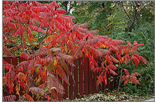
Staghorn Sumac in fall

* This is a 'special order' plant - contact store for details