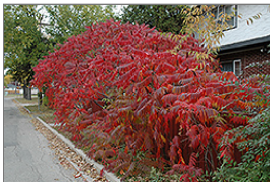
Staghorn Sumac in fall