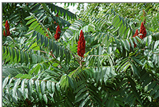
Staghorn Sumac fruit