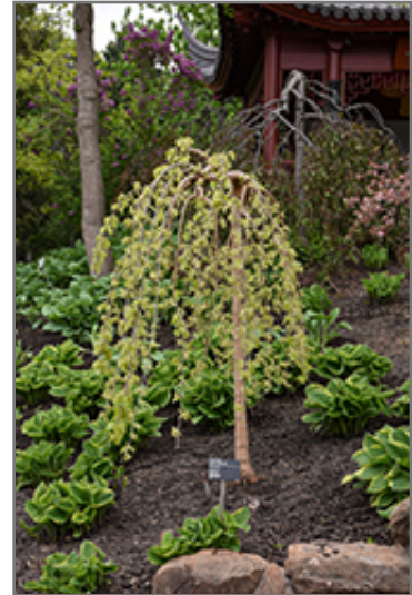
Chaparral Weeping Mulberry in bloom

This shrub performs well in both full sun and full shade. It is very adaptable to both dry and moist locations, and should do just fine under average home landscape conditions. It is considered to be drought-tolerant, and thus makes an ideal choice for xeriscaping or the moisture-conserving landscape. It is not particular as to soil type or pH, and is able to handle environmental salt. It is highly tolerant of urban pollution and will even thrive in inner city environments. This is a selected variety of a species not originally from North America.