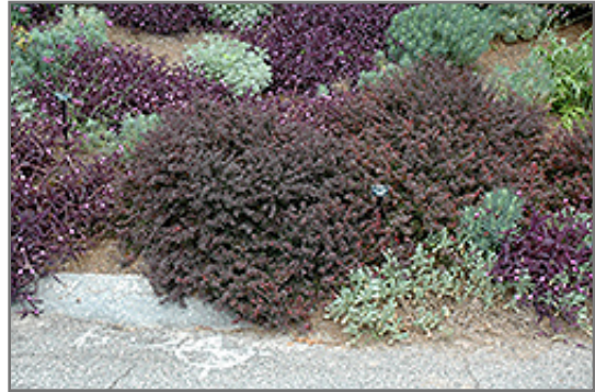
Royal Burgundy Japanese Barberry

Royal Burgundy Japanese Barberry will grow to be about 24 inches tall at maturity, with a spread of 3 feet. It tends to fill out right to the ground and therefore doesn't necessarily require facer plants in front. It grows at a medium rate, and under ideal conditions can be expected to live for approximately 20 years.