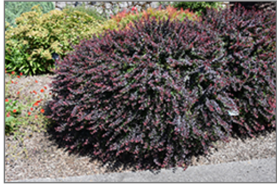
Royal Burgundy Japanese Barberry