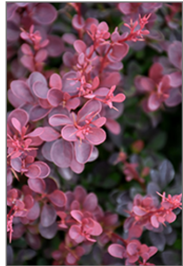
Royal Burgundy Japanese Barberry foliage