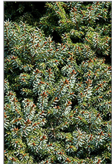
Dwarf Serbian Spruce foliage