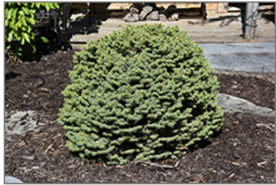
Dwarf Serbian Spruce