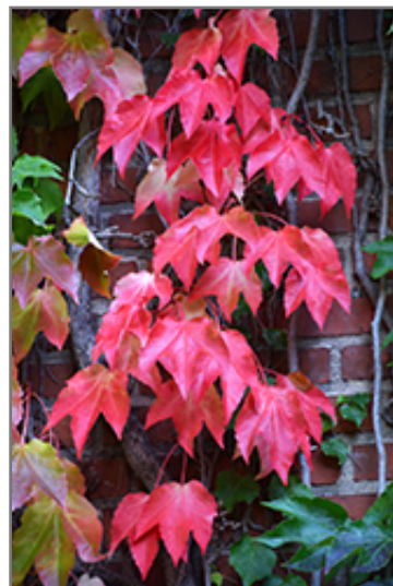
Boston Ivy in fall