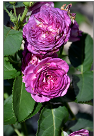
Arctic Blue Rose flowers