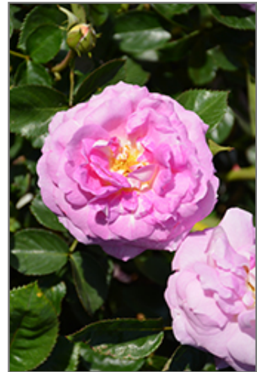
Arctic Blue Rose flowers