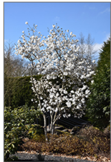
Star Magnolia in bloom