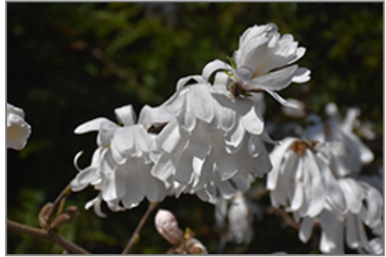
Star Magnolia flowers

This shrub does best in full sun to partial shade. It requires an evenly moist well-drained soil for optimal growth, but will die in standing water. It is not particular as to soil type, but has a definite preference for acidic soils. It is quite intolerant of urban pollution, therefore inner city or urban streetside plantings are best avoided, and will benefit from being planted in a relatively sheltered location. Consider applying a thick mulch around the root zone in winter to protect it in exposed locations or colder microclimates. This species is not originally from North America.