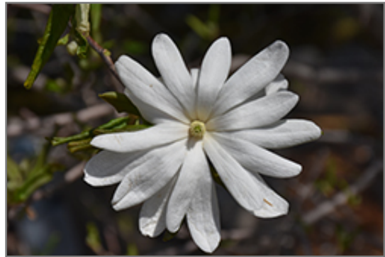
Star Magnolia flowers

Star Magnolia is recommended for the following landscape applications;