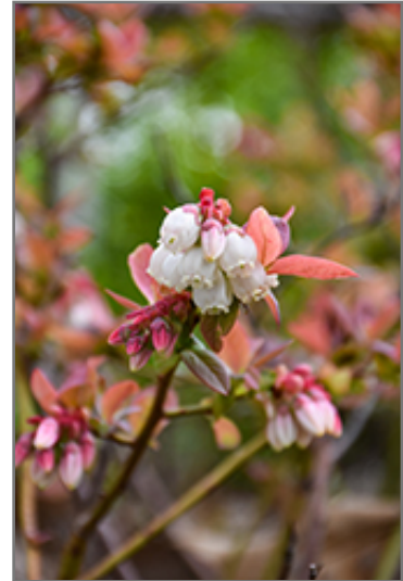
Blueberry Glaze Blueberry flowers

* This is a 'special order' plant - contact store for details