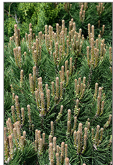
Palouse TRUdwarf Mugo Pine foliage