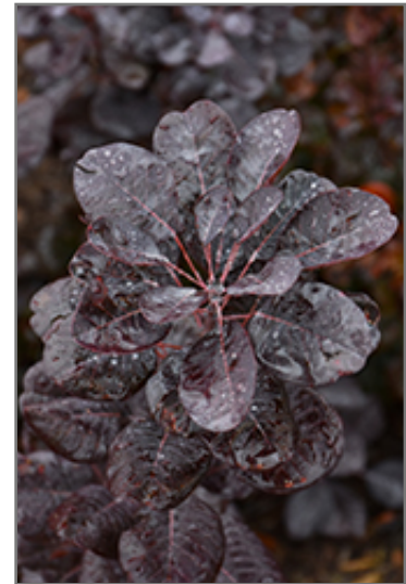
Winecraft Black Smokebush foliage