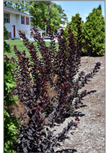
Winecraft Black Smokebush

This shrub should only be grown in full sunlight. It is very adaptable to both dry and moist locations, and should do just fine under average home landscape conditions. It is not particular as to soil type or pH. It is highly tolerant of urban pollution and will even thrive in inner city environments, and will benefit from being planted in a relatively sheltered location. This is a selected variety of a species not originally from North America.