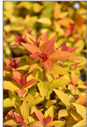
Double Play Candy Corn Spirea foliage

Double Play Candy Corn Spirea is recommended for the following landscape applications;