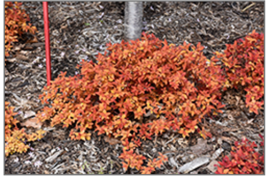
Double Play Candy Corn Spirea

* This is a 'special order' plant - contact store for details