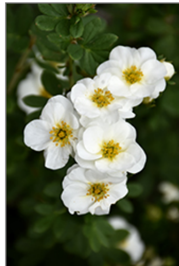
Creme Brulee Potentilla flowers