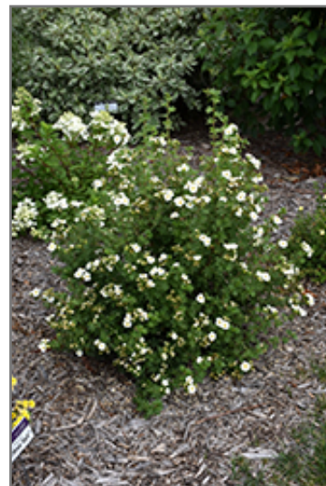
Creme Brulee Potentilla in bloom