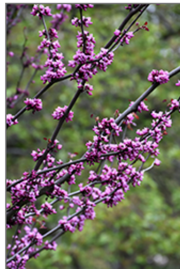
Merlot Redbud flowers