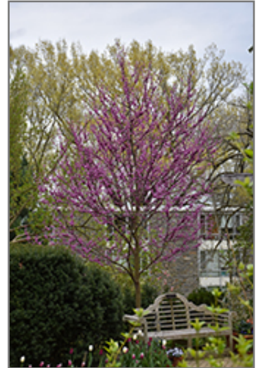
Merlot Redbud in bloom

This tree does best in full sun to partial shade. It prefers to grow in average to moist conditions, and shouldn't be allowed to dry out. It is not particular as to soil type or pH. It is highly tolerant of urban pollution and will even thrive in inner city environments, and will benefit from being planted in a relatively sheltered location. Consider applying a thick mulch around the root zone in winter to protect it in exposed locations or colder microclimates. This is a selection of a native North American species.