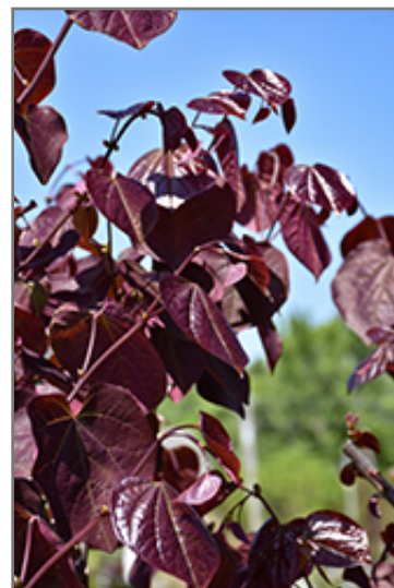
Merlot Redbud foliage