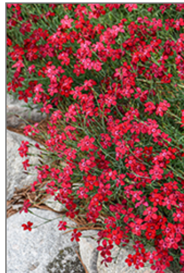
Flashing Light Maiden Pinks flowers

Flashing Light Maiden Pinks is recommended for the following landscape applications;