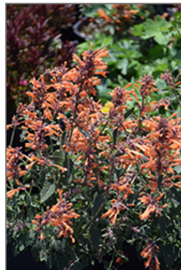
Kudos Mandarin Hyssop flowers