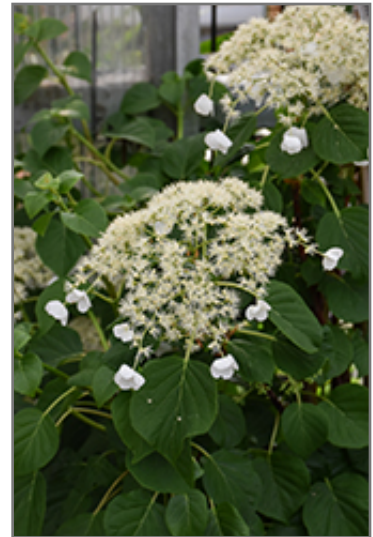
Climbing Hydrangea flowers