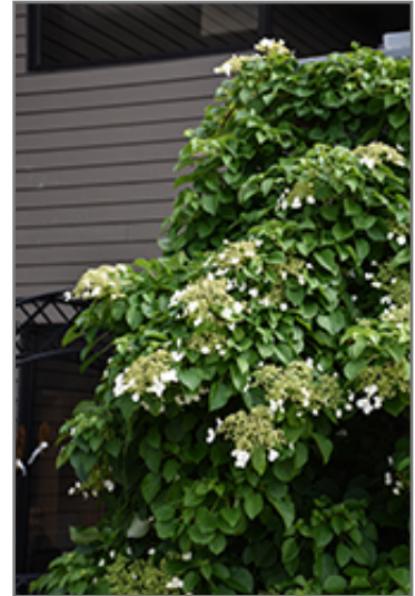
Climbing Hydrangea flowers

This woody vine performs well in both full sun and full shade. It prefers to grow in average to moist conditions, and shouldn't be allowed to dry out. It is not particular as to soil type or pH. It is highly tolerant of urban pollution and will even thrive in inner city environments. Consider applying a thick mulch around the root zone in winter to protect it in exposed locations or colder microclimates. This is a selected variety of a species not originally from North America.