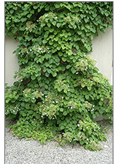
Climbing Hydrangea in bloom