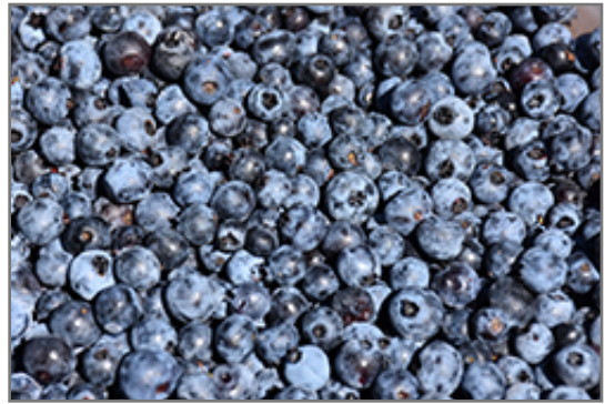
Lowbush Blueberry fruit

Lowbush Blueberry features dainty clusters of white bell-shaped flowers with shell pink overtones hanging below the branches in mid spring. It has dark green deciduous foliage. The oval leaves turn an outstanding scarlet in the fall. It features an abundance of magnificent blue berries in mid summer.