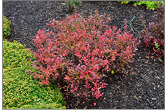
Lowbush Blueberry in fall