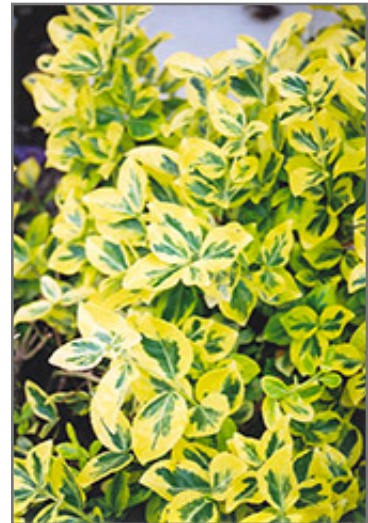
Sungold Wintercreeper foliage