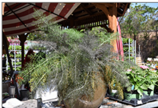
Bronze Fennel

Bronze Fennel has masses of beautiful yellow flat-top flowers held atop the stems in mid summer, which are most effective when planted in groupings. The flowers are excellent for cutting. Its attractive fragrant ferny leaves emerge burgundy in spring, turning bluish-green in color with showy coppery-bronze variegation and tinges of purple throughout the season.