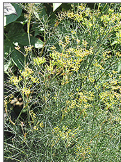
Bronze Fennel in bloom