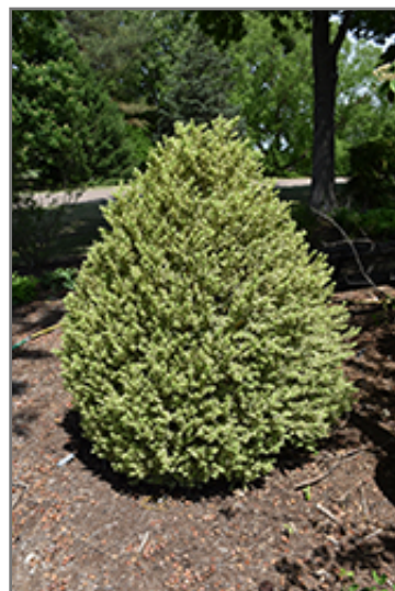
Variegated Boxwood