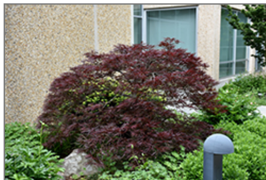
Red Dragon Japanese Maple

This is a relatively low maintenance tree, and should only be pruned in summer after the leaves have fully developed, as it may 'bleed' sap if pruned in late winter or early spring. It has no significant negative characteristics.