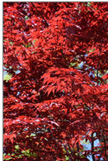
Emperor I Japanese Maple foliage