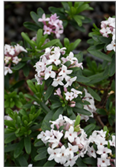
Eternal Fragrance Daphne flowers

Eternal Fragrance Daphne is recommended for the following landscape applications;