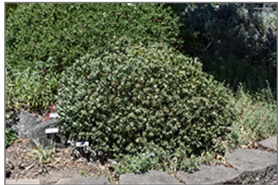
Eternal Fragrance Daphne in bloom