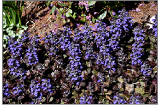
Black Scallop Bugleweed in bloom

* This is a 'special order' plant - contact store for details