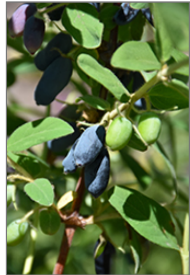
Cinderella Honeyberry fruit

This is a dense multi-stemmed deciduous shrub with a more or less rounded form. Its average texture blends into the landscape, but can be balanced by one or two finer or coarser trees or shrubs for an effective composition. This plant will require occasional maintenance and upkeep, and is best pruned in late winter once the threat of extreme cold has passed. It is a good choice for attracting butterflies to your yard. It has no significant negative characteristics.