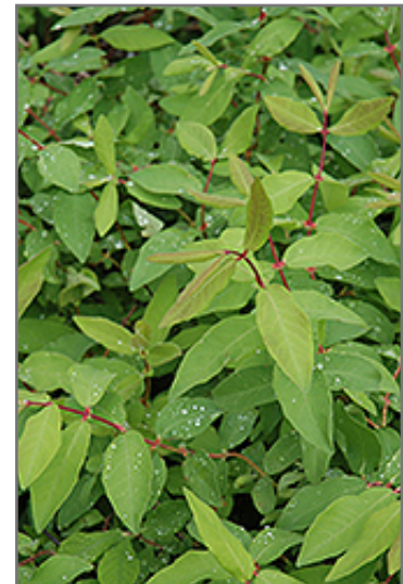
Cinderella Honeyberry foliage