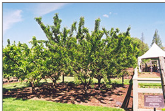
Mount Royal Plum

This tree is typically grown in a designated area of the yard because of its mature size and spread. It should only be grown in full sunlight. It does best in average to evenly moist conditions, but will not tolerate standing water. It is not particular as to soil type or pH. It is highly tolerant of urban pollution and will even thrive in inner city environments. This particular variety is an interspecific hybrid.