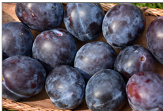
Mount Royal Plum fruit