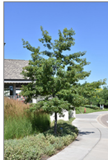
Majestic Skies Northern Pin Oak