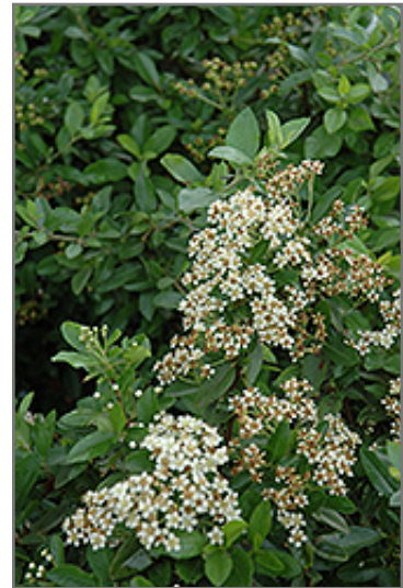
Lowboy Scarlet Firethorn flowers