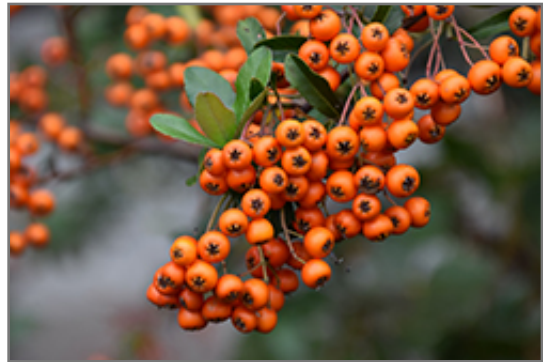
Lowboy Scarlet Firethorn fruit

Lowboy Scarlet Firethorn is recommended for the following landscape applications;