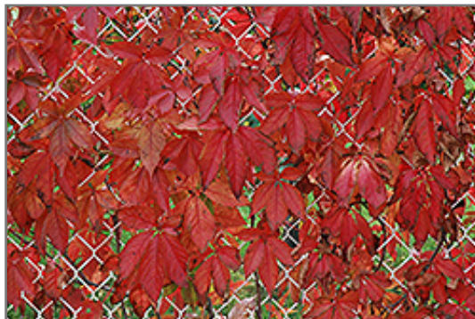
Englemann Ivy in fall