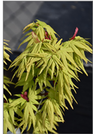
Mikawa Yatsubusa Japanese Maple foliage

Mikawa Yatsubusa Japanese Maple is recommended for the following landscape applications;