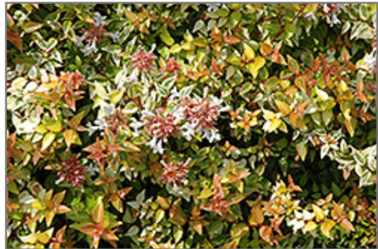
Kaleidoscope Abelia flowers

This shrub will require occasional maintenance and upkeep, and should only be pruned after flowering to avoid removing any of the current season's flowers. It is a good choice for attracting birds, bees and butterflies to your yard, but is not particularly attractive to deer who tend to leave it alone in favor of tastier treats. It has no significant negative characteristics.