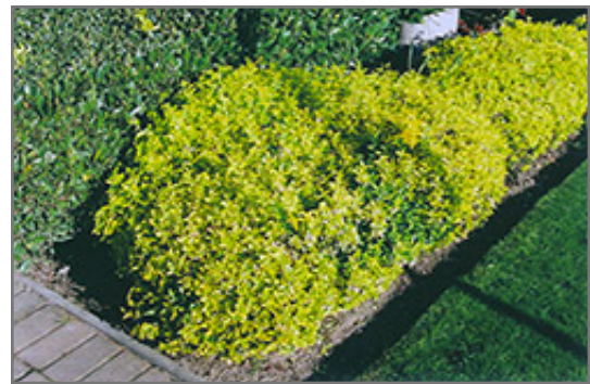
Gold Prince Wintercreeper