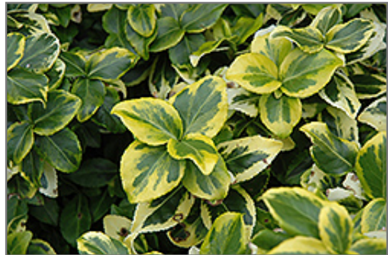
Gold Prince Wintercreeper foliage