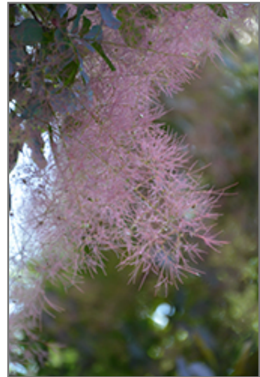
Royal Purple Smokebush flowers

This shrub should only be grown in full sunlight. It is very adaptable to both dry and moist locations, and should do just fine under average home landscape conditions. It is not particular as to soil type or pH. It is highly tolerant of urban pollution and will even thrive in inner city environments, and will benefit from being planted in a relatively sheltered location. This is a selected variety of a species not originally from North America.