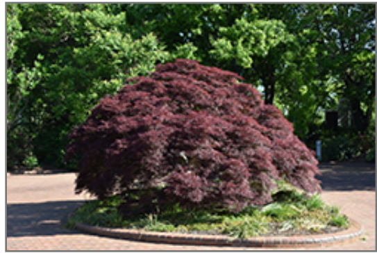
Purple-Leaf Threadleaf Japanese Maple

Purple-Leaf Threadleaf Japanese Maple is recommended for the following landscape applications;