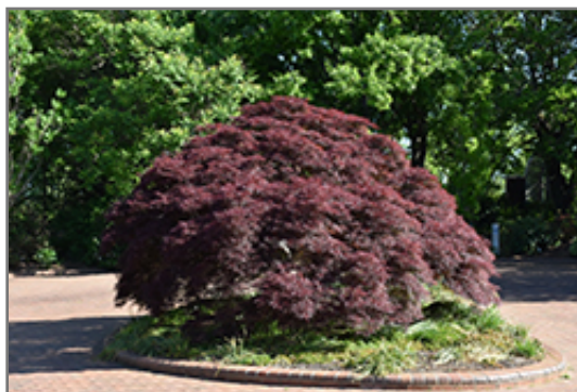
Purple-Leaf Threadleaf Japanese Maple

Purple-Leaf Threadleaf Japanese Maple is recommended for the following landscape applications;