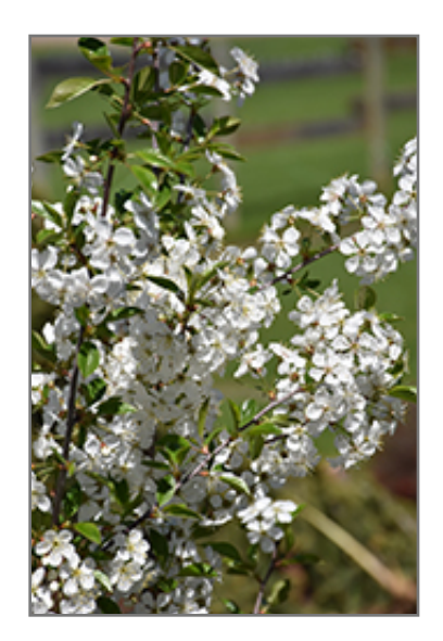
Juliet Cherry flowers