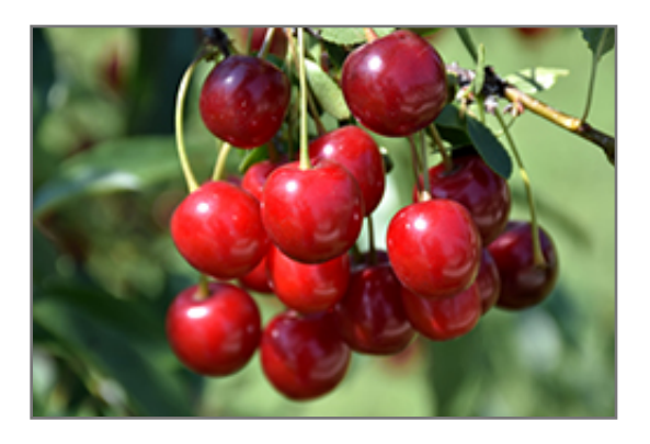
Juliet Cherry fruit

Juliet Cherry features showy clusters of fragrant white flowers along the branches in mid spring. It has green deciduous foliage. The glossy oval leaves turn yellow in fall. The fruits are showy dark red drupes carried in abundance from mid to late summer.